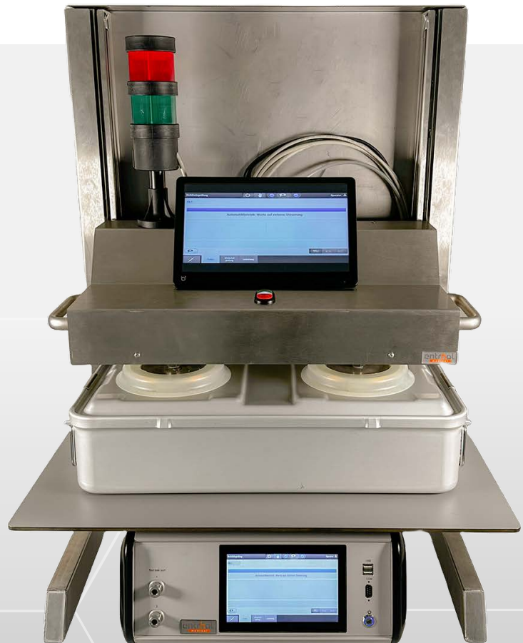
Fig. Conteg Pro